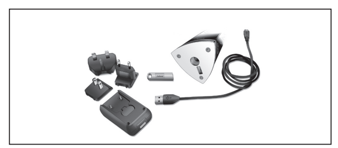
The Jabra Noise Guide comes with the main Noise Guide unit; an 8 GB USB key with software; a power adaptor with EU, UK and US plugs; and a USB cable to connect the Noise Guide to the power adaptor or a PC.