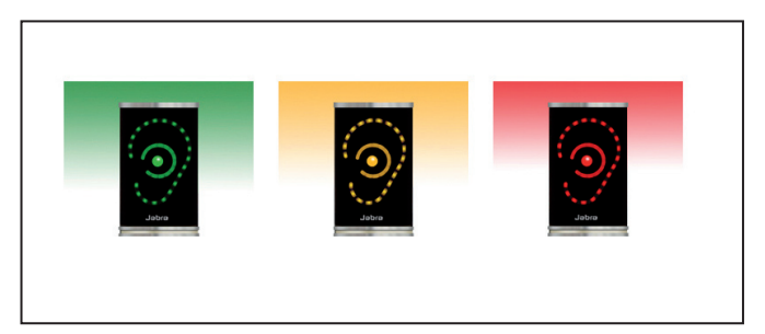
Standard settings are:

Green Ear : < 60 dB, Yellow Ear : 60 - 70 dB, Red Ear : > 70 dB.