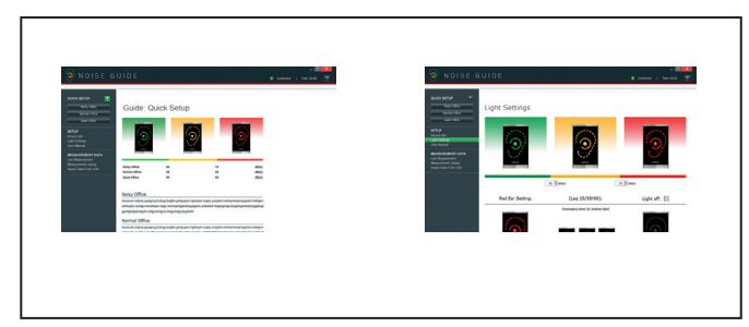
The Jabra Noise Guide comes pre-set for "Noisy Office" but settings can easily be changed using the software.