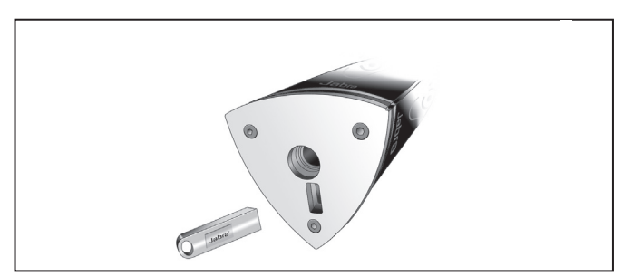
Plug and play with USB connection for fast set up.